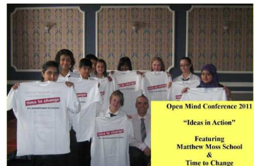
Planning meetings before the big day.

The pupils went on to give the audience a thought provoking factual presentation on mental health awareness. This promoted knowledge and insight towards a wide range of mental health diagnosis's, mental health symptoms and the various treatments that are associated with mental health symptoms. The presentation, which was eloquently delivered, also wholeheartedly challenged the stigma, prejudice and discrimination that exists within our society with regards to mental illness.